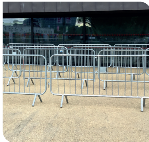
2.3m Pedestrian Barriers in situ