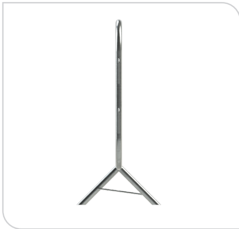
Features Fixed Feet